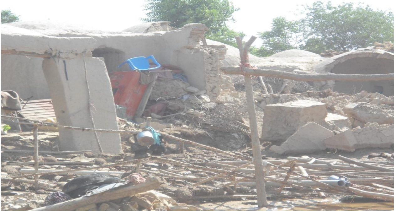
Destroyed House in Faizabad district in Jawzjan Province