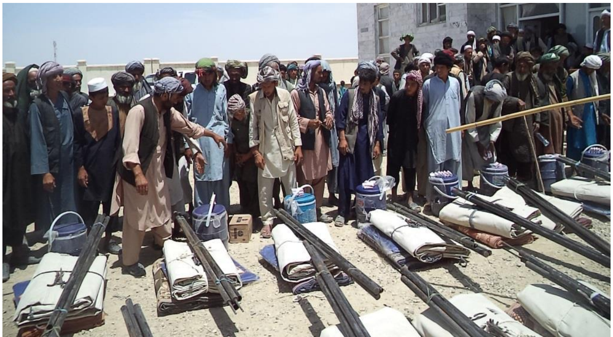
Beneficiaries ready to transport the received NFIs items