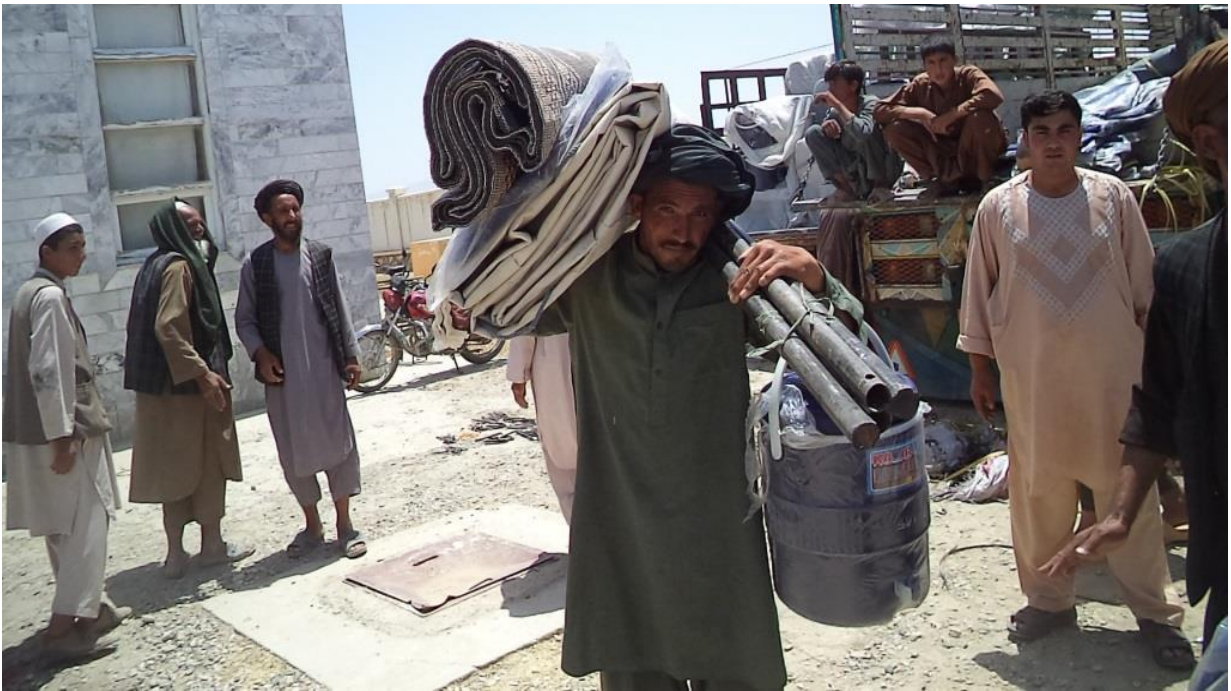
All set for new shelter