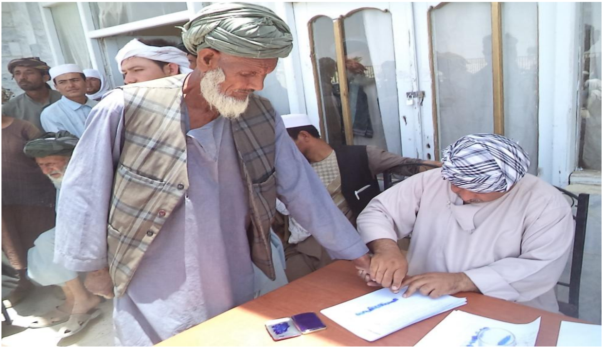
Evidence and Documentation – beneficiary registration as an evidence for recipient of NFIs